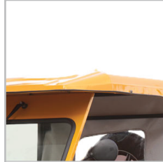
Driver Roof & Laminated Glass