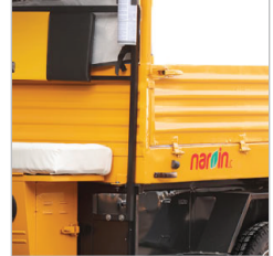
Heavy Duty Chassis